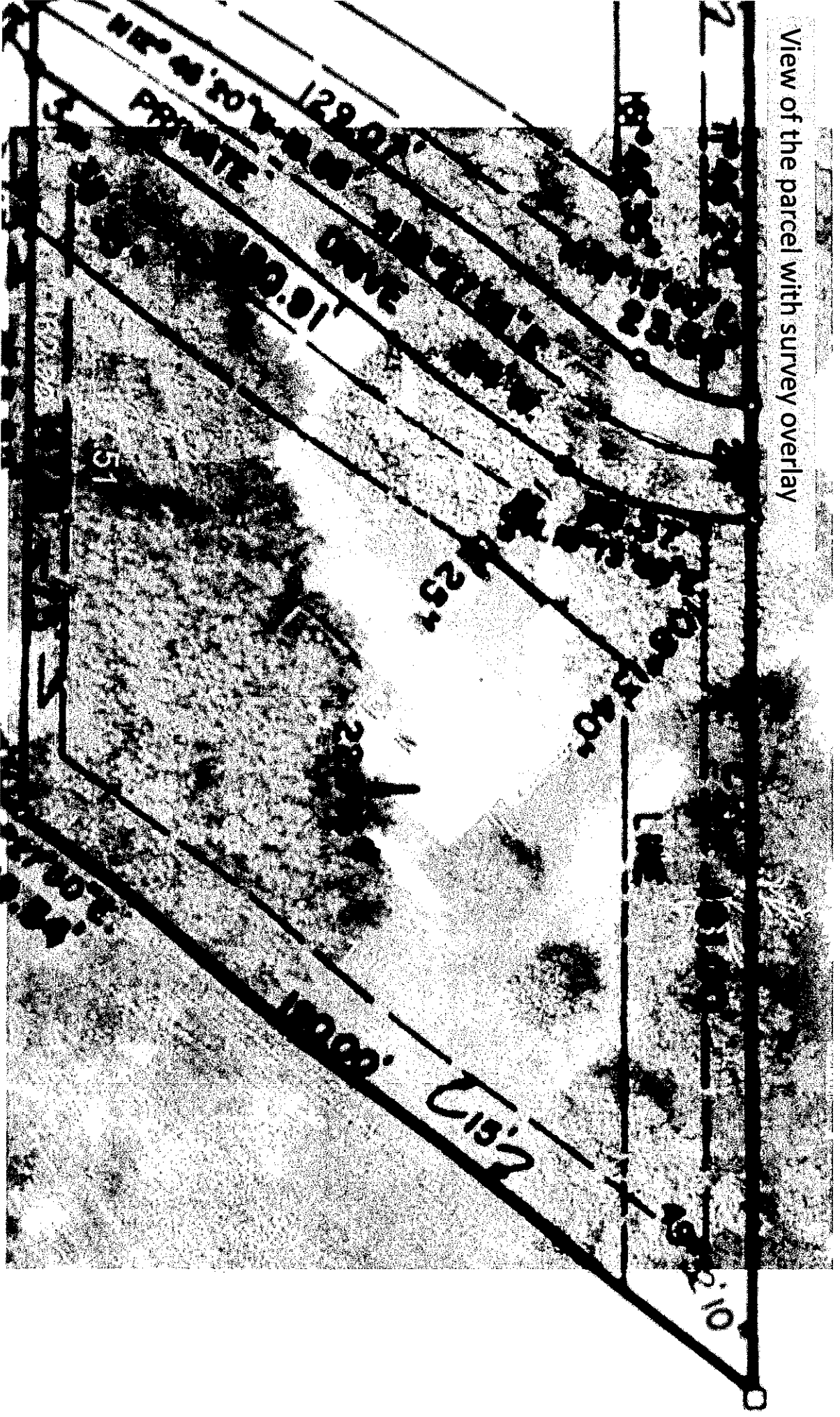
View of the parcel with survey overlay